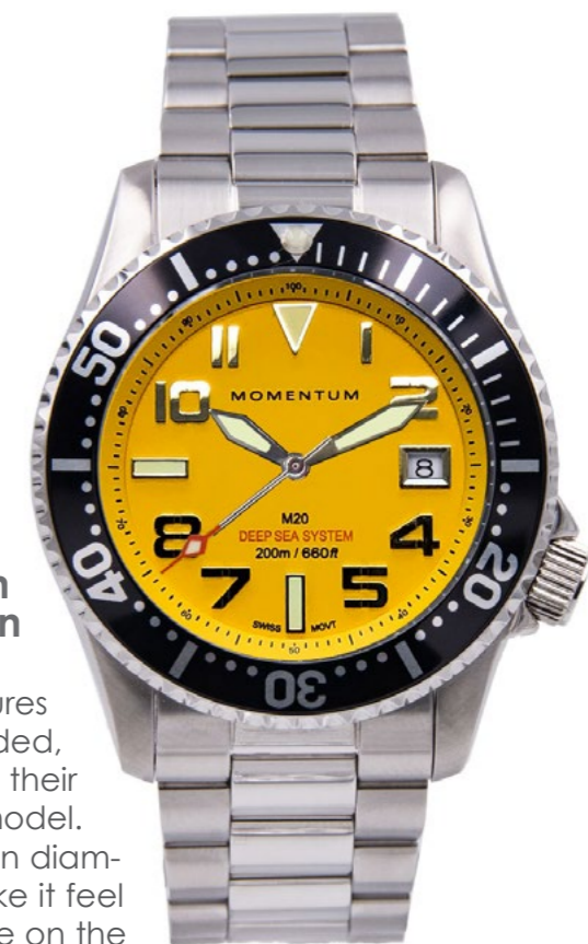
Momentum M20 DSS with Bahama Yellow Dial option

The M20 DSS dive watch features a 316L stainless steel rounded, polished case reminiscent of their original 1990's Aquamatic model. The case is just under 42mm in diameter but the smooth curves make it feel smaller and more comfortable on the wrist. Don't let its good looks deceive you, the M20 DSS Diver is durable and adventure-ready, with an off-set screw-down crown and 200m-rating. It is also extremely legible day or night, with a double-dome sapphire crystal that features an anti-reflective coating and indices that contain Super-LumiNova lume. momentumwatch.com