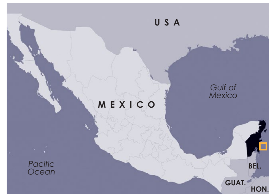
Location of Banco Chinchorro, Quintana Roo, on map of Mexico

Is it dangerous? Probably and possibly are the best descriptors, as there is no doubt that they could inflict serious harm, but nobody has been attacked. Is it special? Yes, for sure it is—being so close to such large and potentially dangerous reptiles is something else. Plus, the whole experience of staying in the fishermen's palafito hut with no running water and just a small generator for power is very different. Was it worth the marathon journey? Australia is a long way from everywhere, and a really long way from Banco Chinchorro—but yes, it was