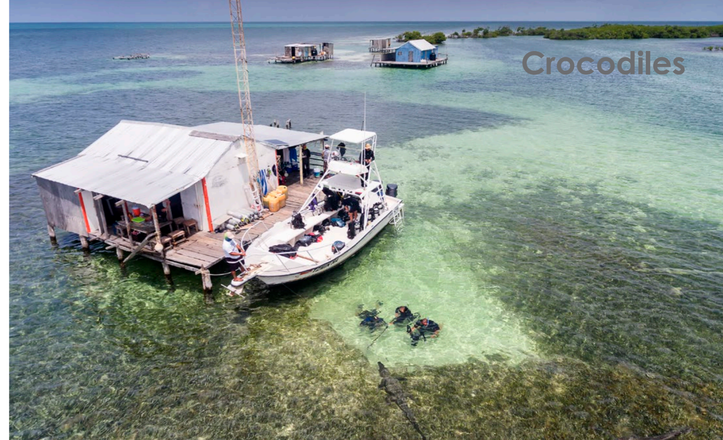
Dive boat moored at a small fishing hut, or palafitos (above), while divers in the water photograph a croc on the seagrass bed; Croc eating lionfish bait (left); Croc raising its head for a breath (right)