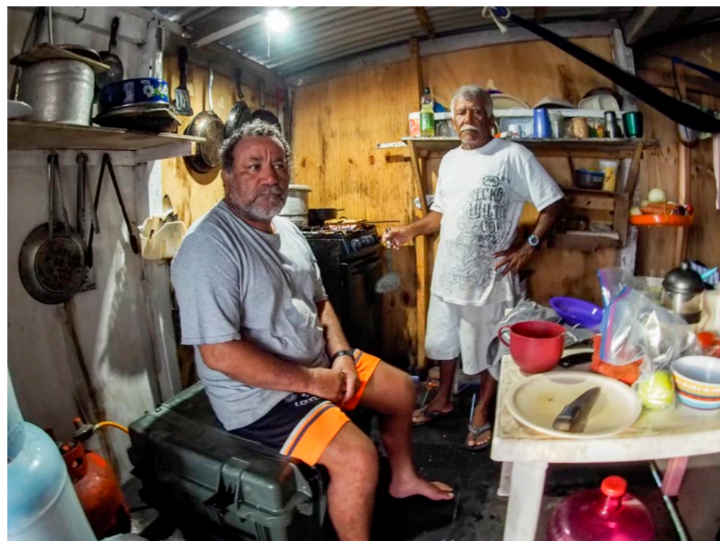
Local fishermen rest inside their fishing hut at Banca Chinchorro

In-water encounters with the American crocodiles of Banco Chinchorro are done on snorkel, as it is too shallow for scuba near the palafitos , plus it is easier to manoeuvre when unencumbered. Positioning and visibility are the key to safe encounters and our palafito had some prime real estate just in front of its main porch in the form of a large sandy patch that stretches out to the left of the hut.