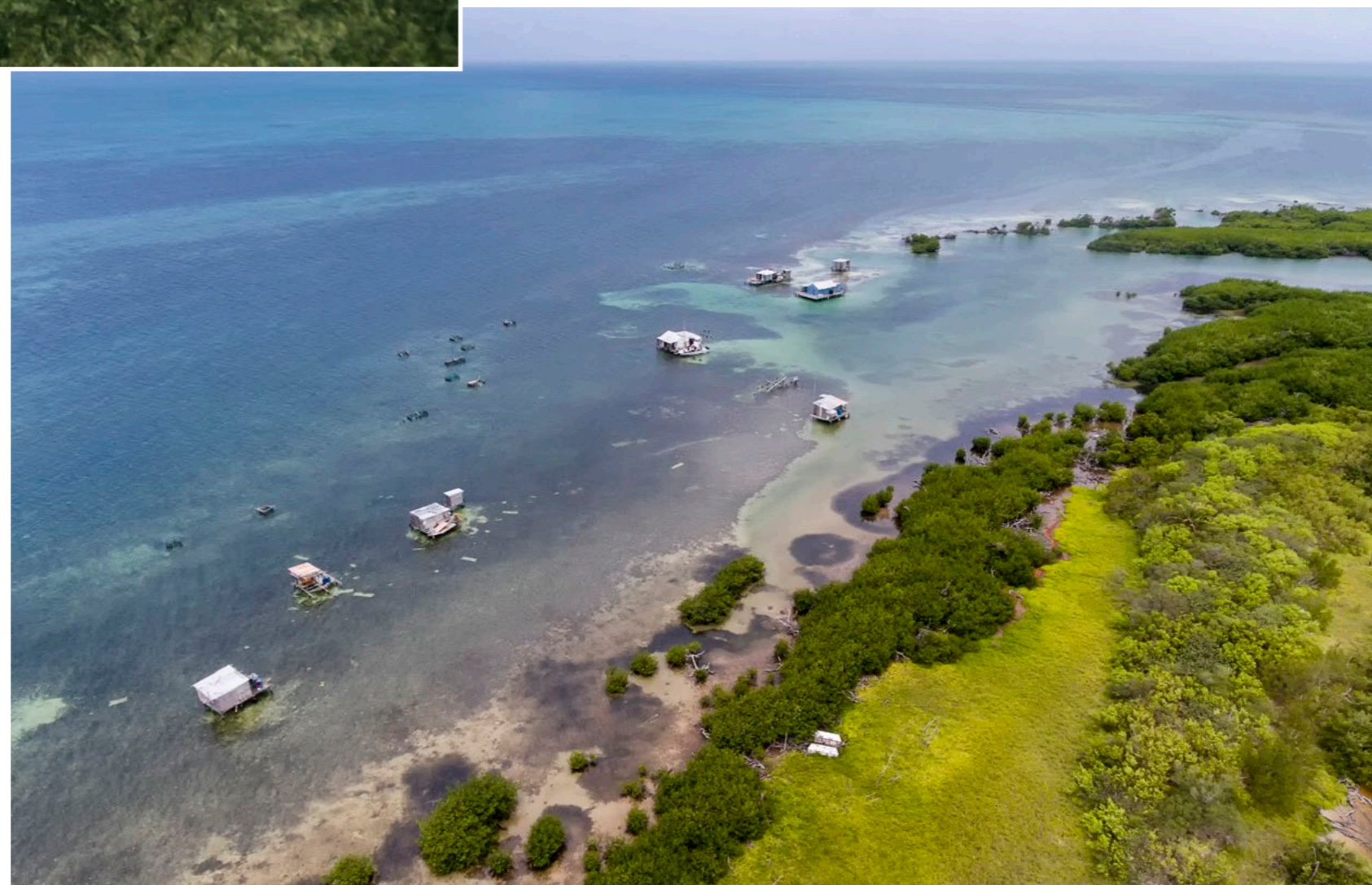
Small fishing huts called palafitos dot Banco Chinchorro (above); Croc at surface (top left) and resting on seagrass bed (top right)

But if it's the crocodiles you are after, Cayo Centro is where you need to be. Although only just under 6 sq km in size, Cayo Centro is the largest of the three islands on the atoll and is home to a permanent estimated population of between 300 to 500 American