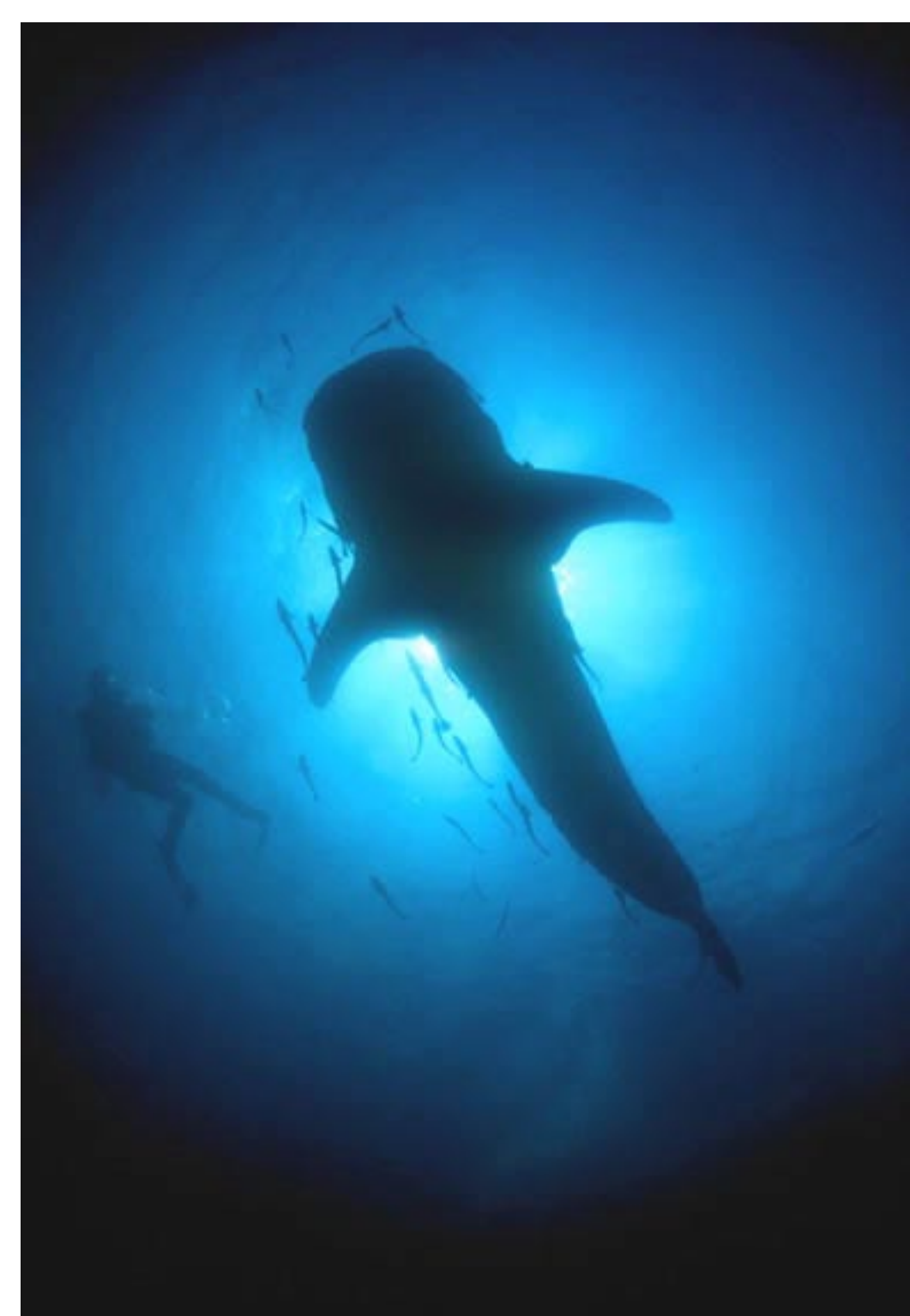
ABOVE: Diver and Whaleshark