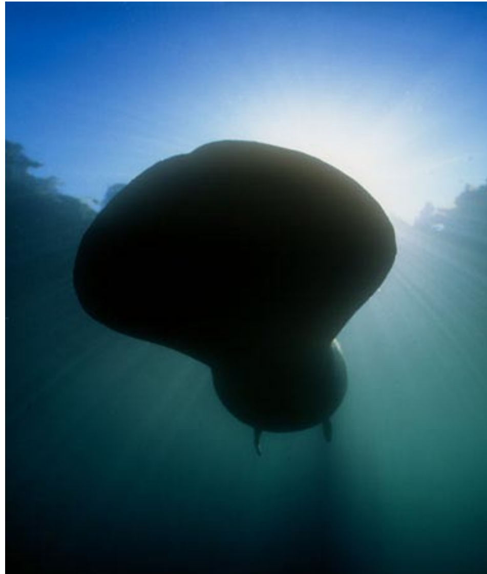
Tail end of a dugong

and masts that still reach far above the decks toward the surface and make ascending both enjoyable and interesting.