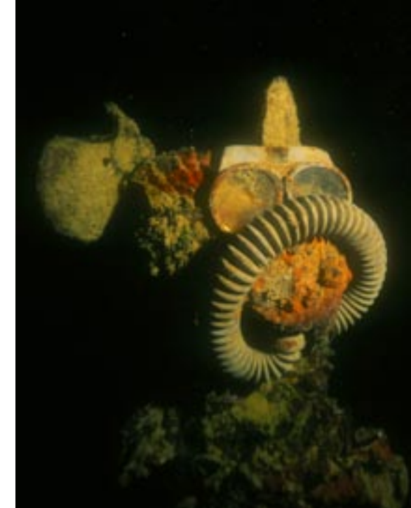
World War II gas mask