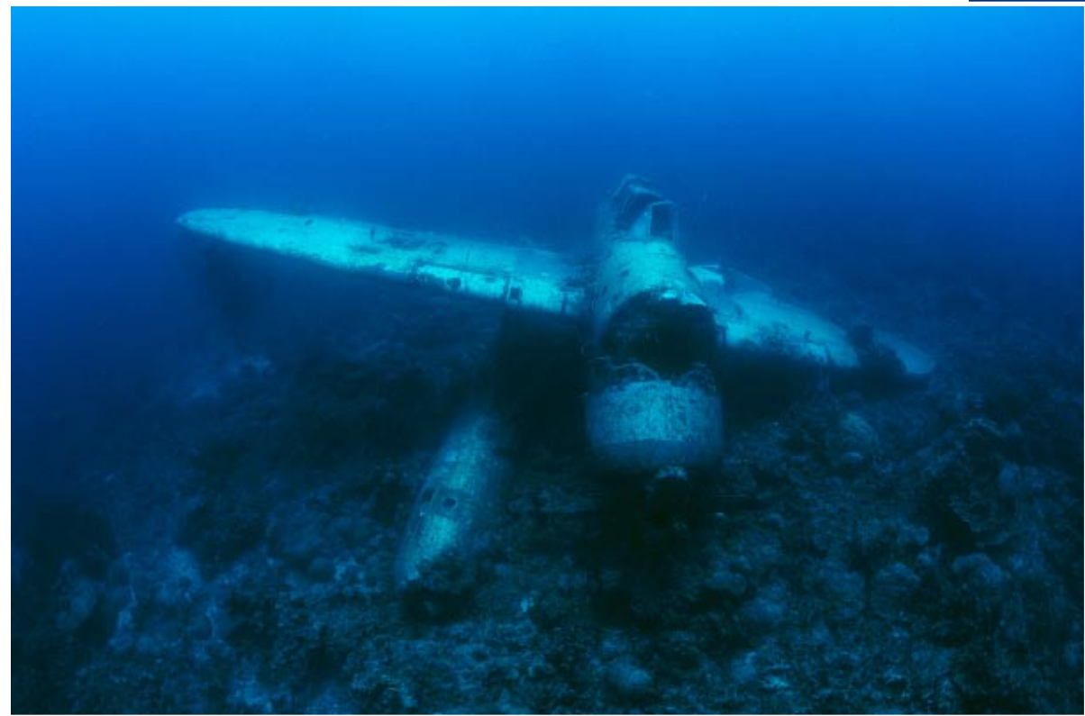
ABOVE: Japanese warplane LEFT: Shells and gas mask of the Helmet wreck, Palau

plateaus that jut out into the Philippine Sea generate incredible currents, which in turn support an incredibly complex reef ecosystem that includes some of the highest marine diversity in the world. Corals, gorgonians, sponges, and an endless variety of reef fishes seem to be everywhere.