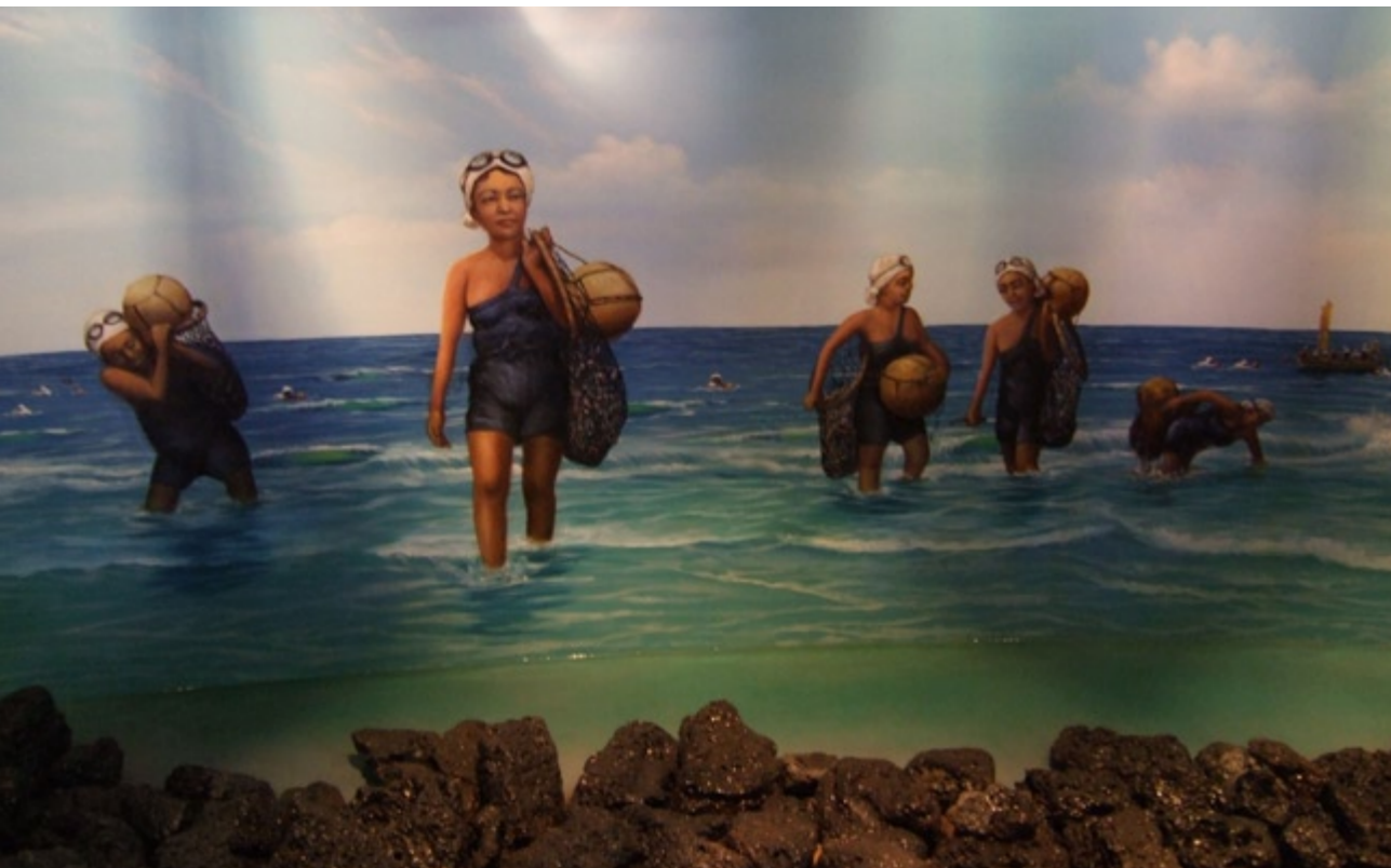
Painting of the haenyeos coming from the sea. Painting hangs in the Haenyeo Museum in Jeju

When a diver loses her life, the women stop diving for a while. If they find the body, they have a funeral, but if they fail to find the body, a shaman is invited to soothe the soul of the body and send it to heaven. The shaman also performs an exorcism to prevent evil spirits from preventing further disasters.