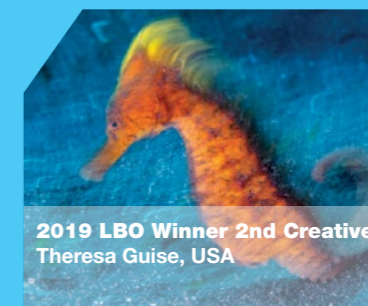
2019 LBO Winner 2nd Creative Theresa Guise, USA