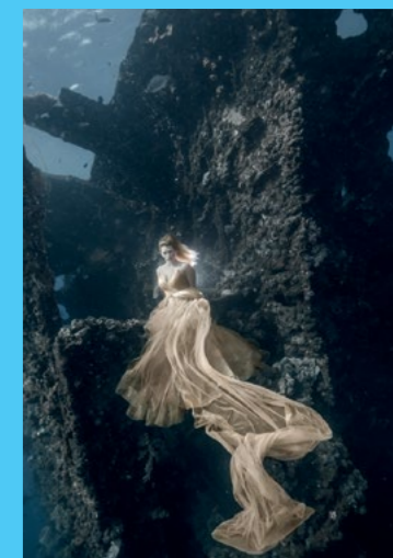
2019 LBO Winner Best of Show Leonard Lim, Singapore