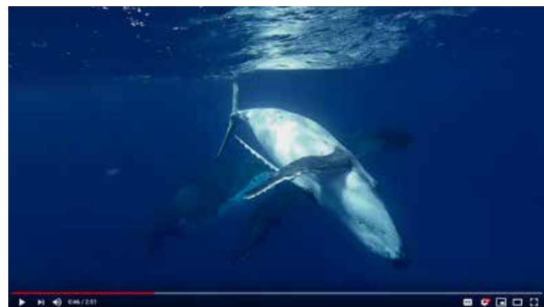
Video Category – First Prize: Whale Totem , by Simone Piccoli of Italy ( https://www.youtube.com/watch?time_continue=8&v=sYXRcav2_bE )

There was a 15 per cent increase in non-divers attending the expo, totaling 1,296, of which 36 tried scuba diving for the first time in the on-site pool through the "Be a Diver" program and another 258 signed up for scuba diving courses. DiveDivas Fanclub