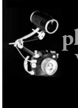
photo & video

and Sun Dauin, Komodo/Raja Ampat, Nusa Penida, Pura Vida, Thalassa and Waiwo Dive Resorts Raja Ampat. Additional prizes were provided by Crest and Enth Degree.