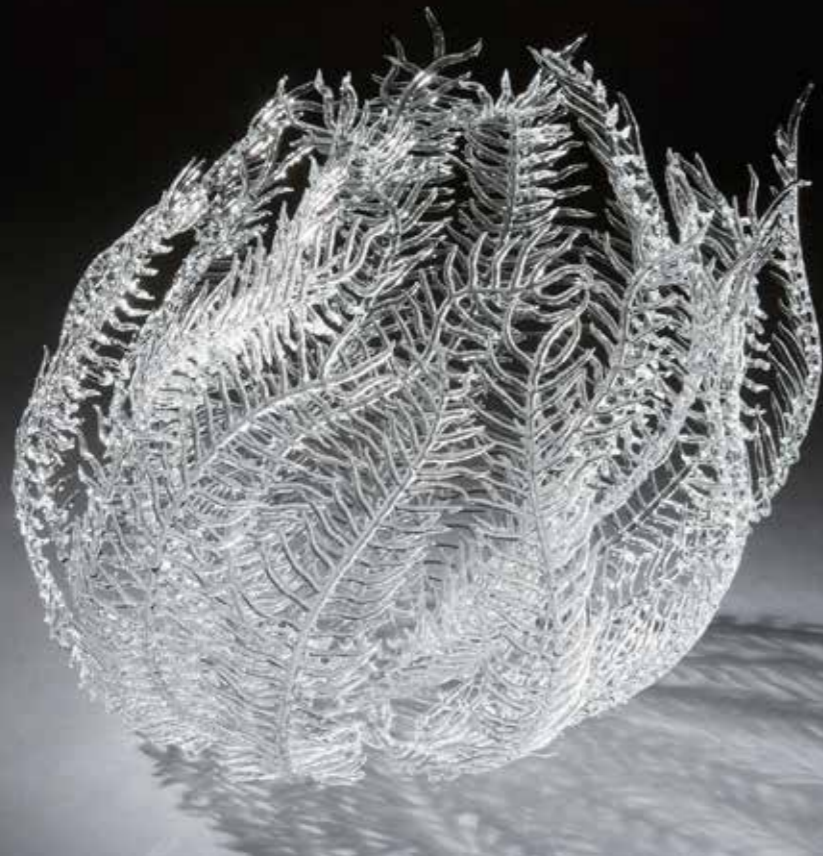
Alternate view of Glass Seaweed by Emily Williams

I only work on one piece at a time, but while I work, I am already building new sculptures in my mind. For months I have been installing new glass torches and stockpiling transparent colored glass for new coral sculptures.