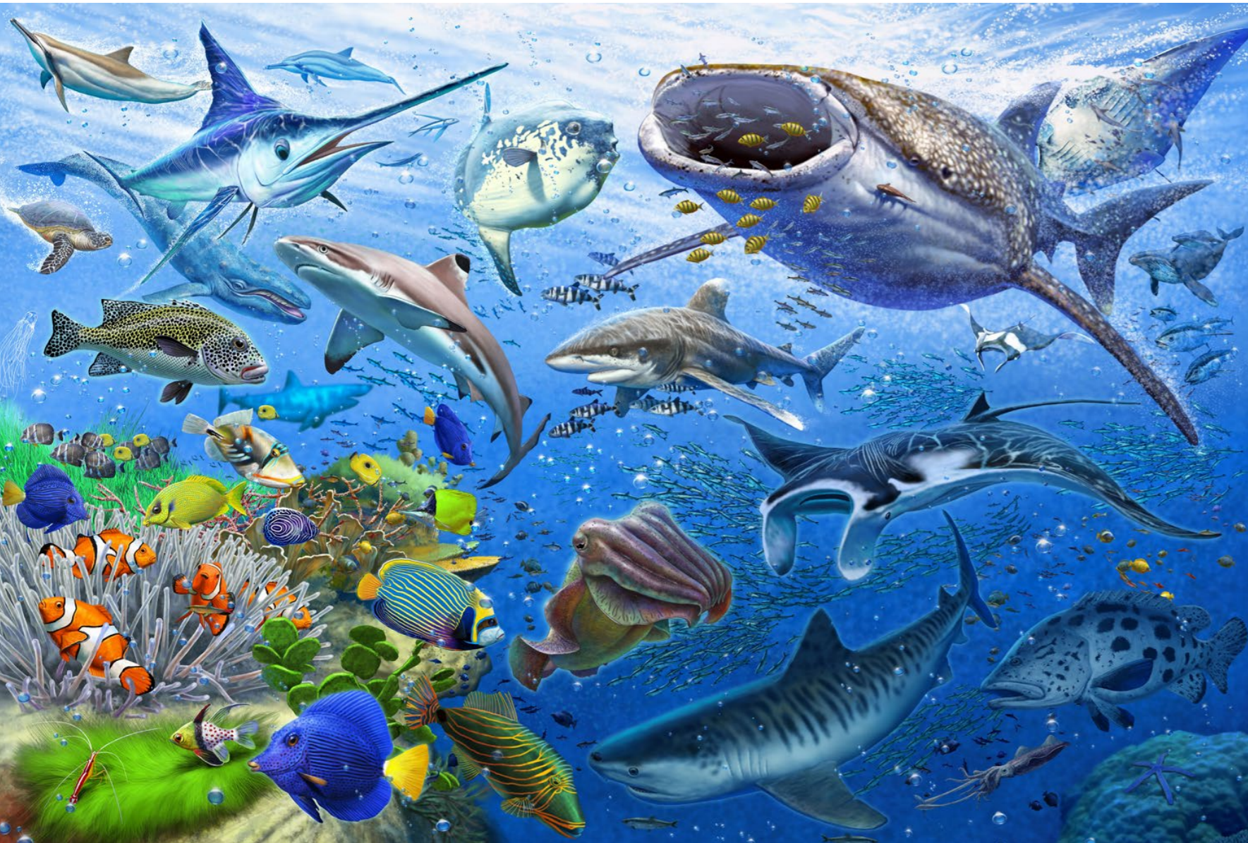
Under the Sea , by Rudolf Farkas. Digital illustration, 660 x 480mm, 300 dpi

X-RAY MAG: What are the challenges or benefits of being an artist in the world today? Any thoughts or advice for aspiring artists in ocean arts?