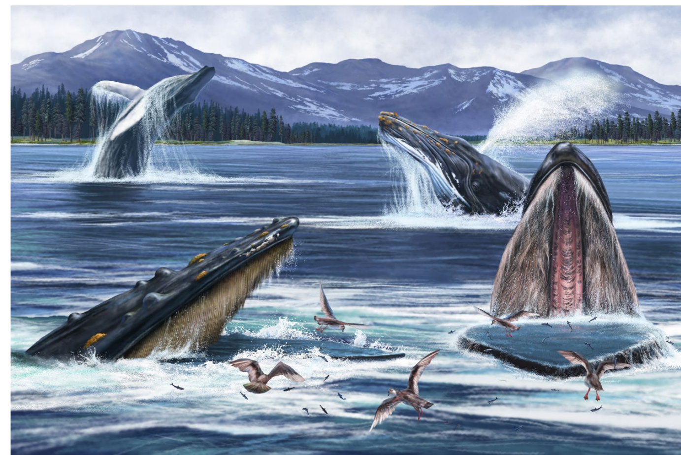
Ecosystem of the Deep Sea, by Rudolf Farkas. Digital illustration, 210 x 297mm, 300dpi (above); Humpback Whales Hunting, by Rudolf Farkas. Digital illustration, 210 x 297mm, 300dpi (right)