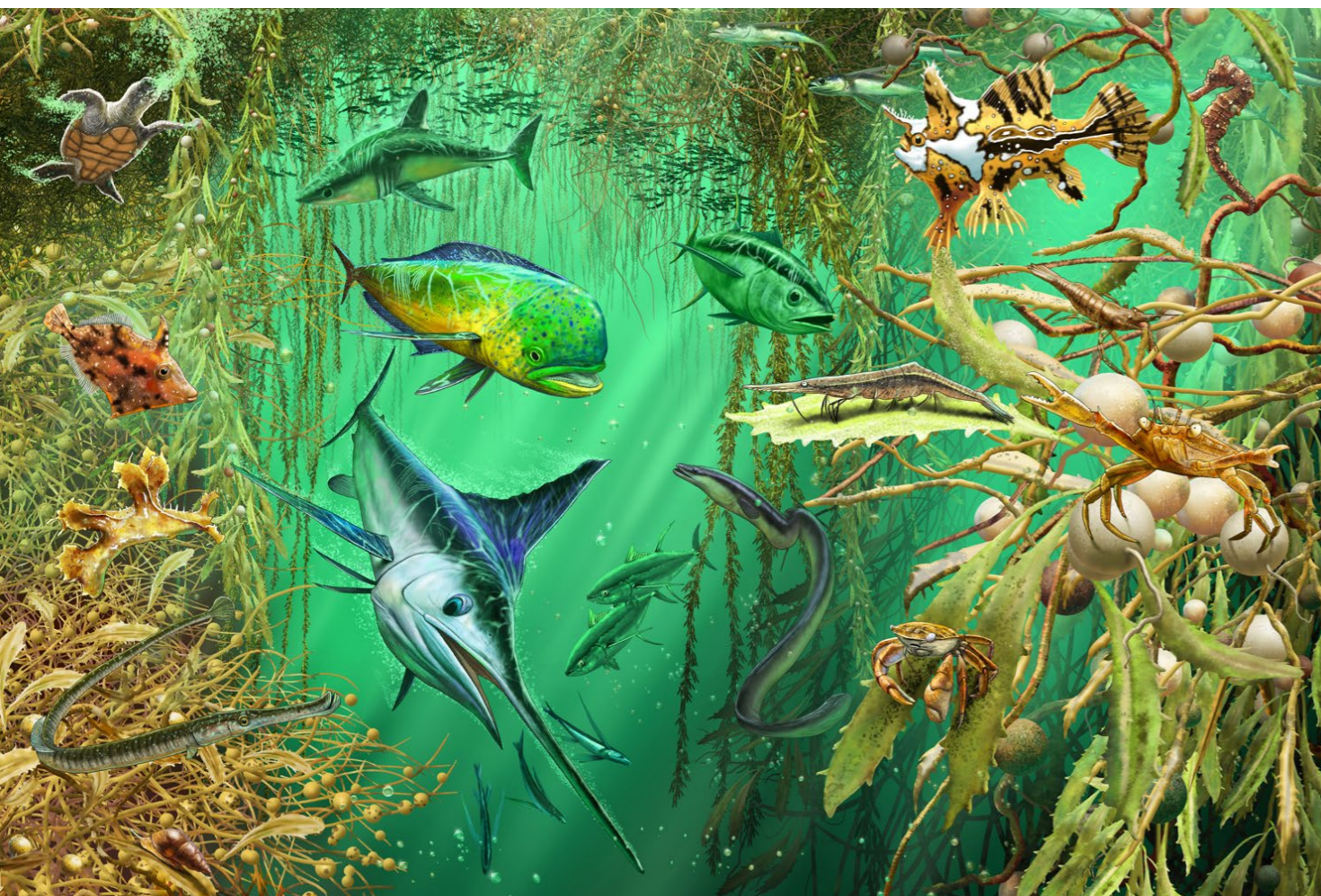
Ecosystem of the Monterey Bay , by Rudolf Farkas. Digital illustration, 210 x 297mm, 300dpi (above); Hunting at Night , by Rudolf Farkas. Digital illustration, 148 x 210mm, 300dpi (top left)

X-RAY MAG: Why marine life and underwater themes? How did you come to these themes and how did you develop your style of painting?