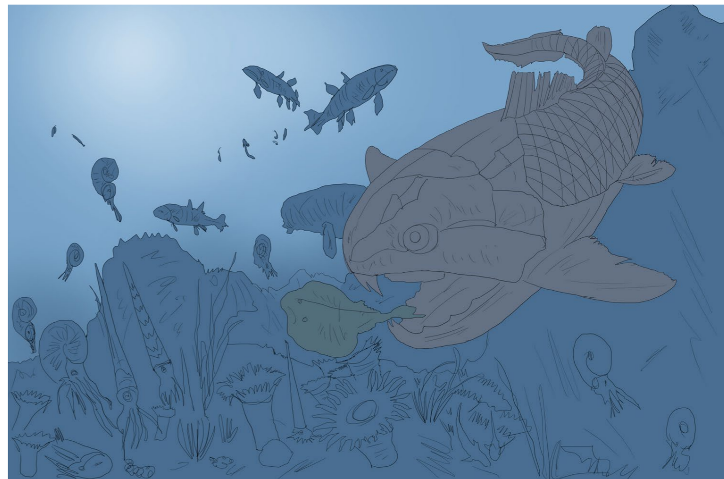
Devonian Marine Life , by Rudolf Farkas. Digital illustration, 210 x 297mm, 300dpi —the initial rough sketch (above) for the finished work (top right)