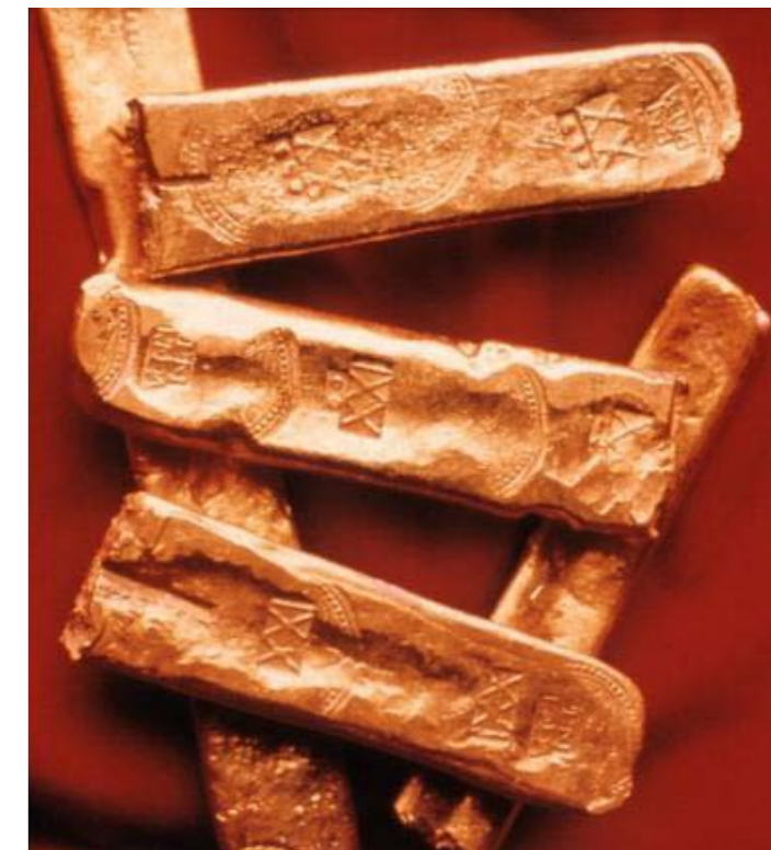
ABOVE: Gold bars recovered from the 1622 "Tortugas" shipwreck site

tutions can't afford to fund archaeologically-sensitive shipwreck exploration on the scale we're doing it.