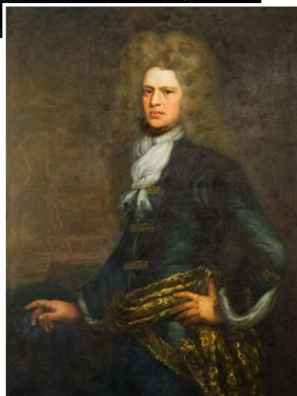
Portrait of Admiral Sir John Balchin, commander of HMS Victory during her last voyage in October 1744