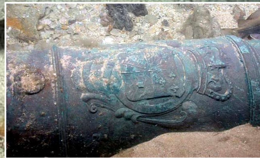
Bronze cannon protruding from the seabed at the wreck site of HMS Victory , bears the royal crest of King George I (inset)