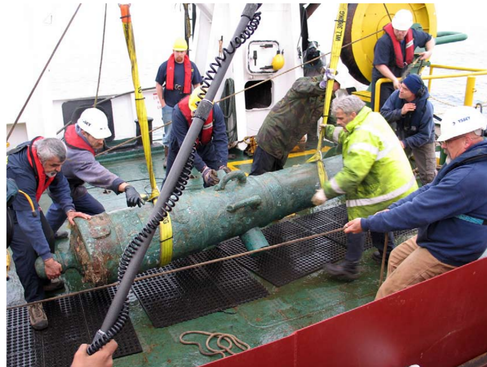
A 42-pound bronze cannon from the wreck of the HMS Victory being hoisted onto the deck of the Odyssey Explorer

MK: Being a salvage company, you meet a lot of harsh opinions about what you do. Opinions about how shipwrecks of archeo-