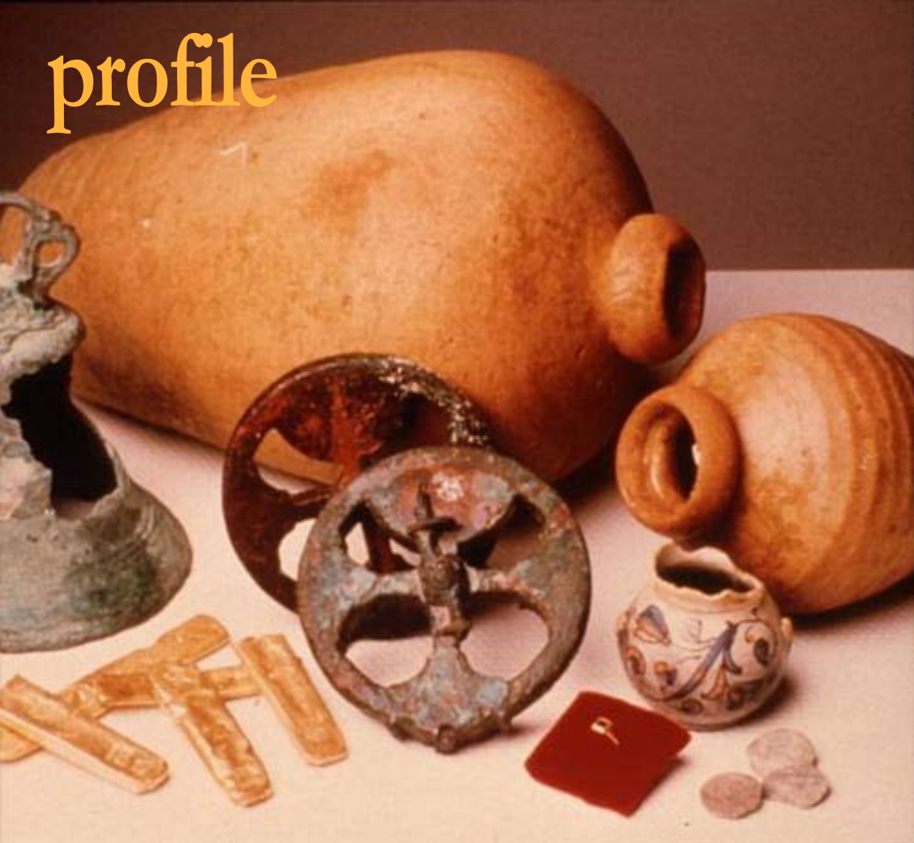
Artifacts recovered from the 1622 "Tortugas" shipwreck site BELOW CENTER: Ceramic cargo from the "Blue China" wreck at a depth of nearly 1,200 feet

factors. It is fast becoming a race against time, and it is really crucial at this juncture to address this issue.