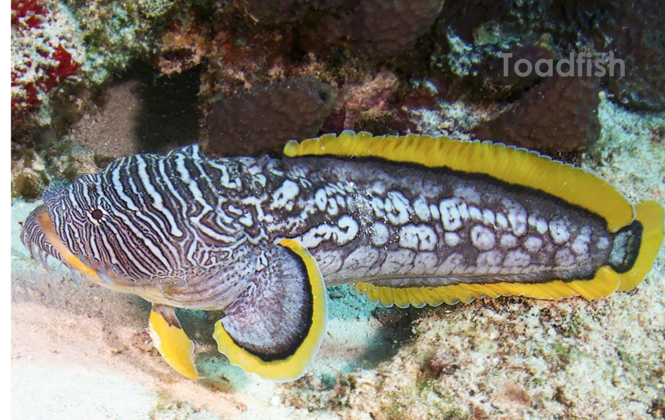
Splendid toadfish are named so for the flamboyant stripes and blotchy markings on their bodies. They come out at night to hunt (right).