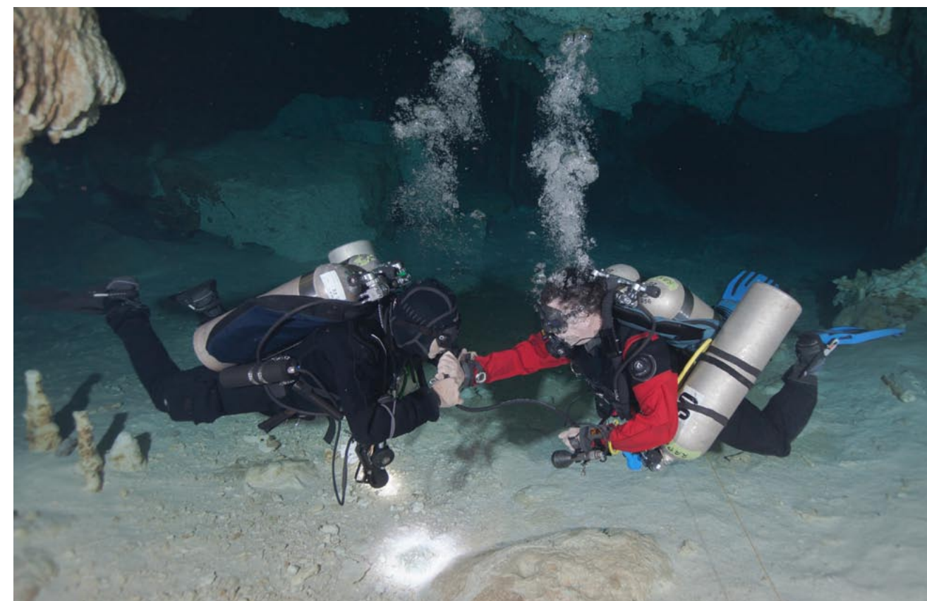
Out of gas

A frequent fear is the course's difficulty, with some people imagining the train-