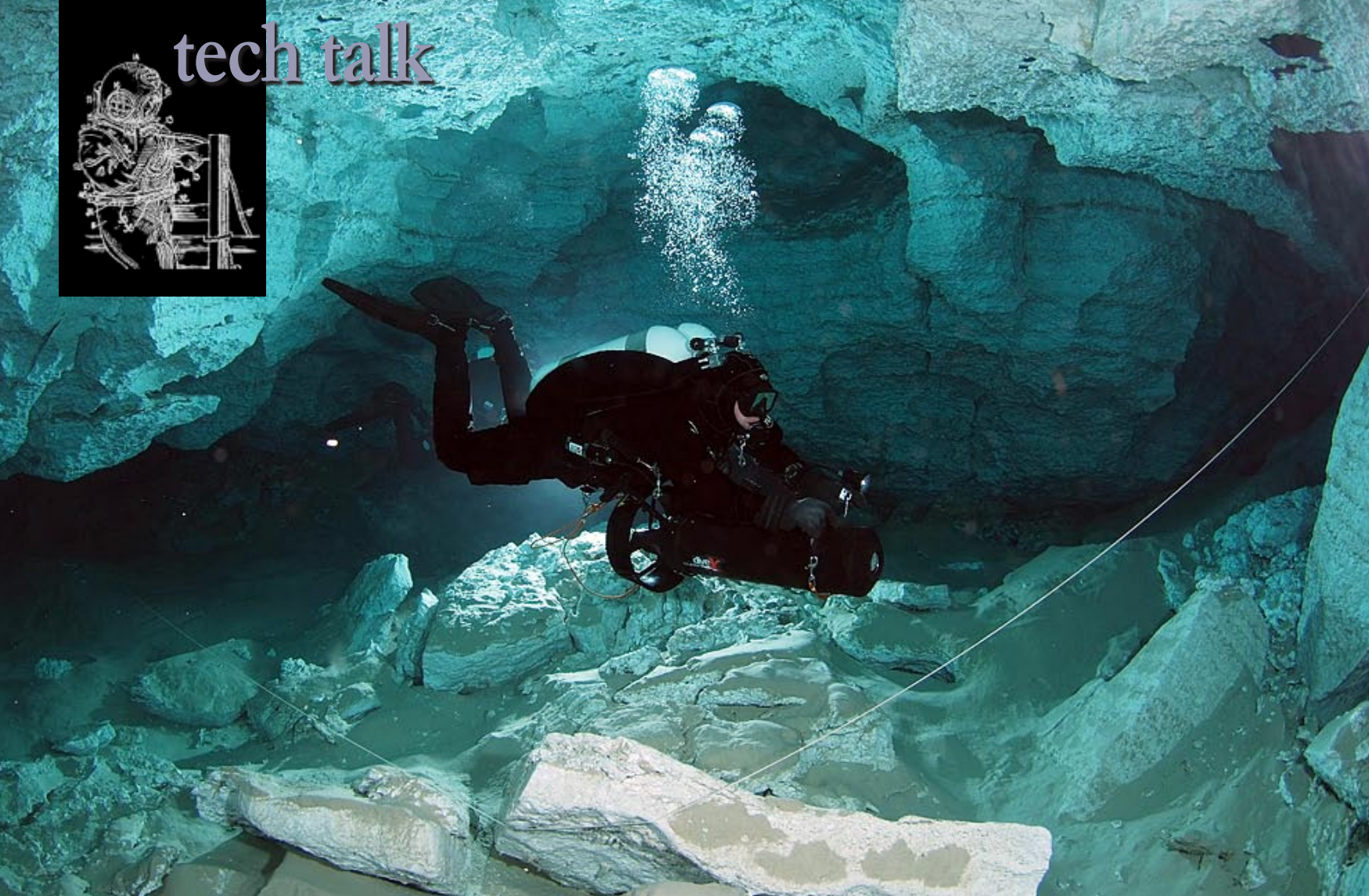
Scooter diving in Orda Cave.

main and secondary galleries, complex navigational elements using arrows and cookies to communicate on the guideline and locating the exit.