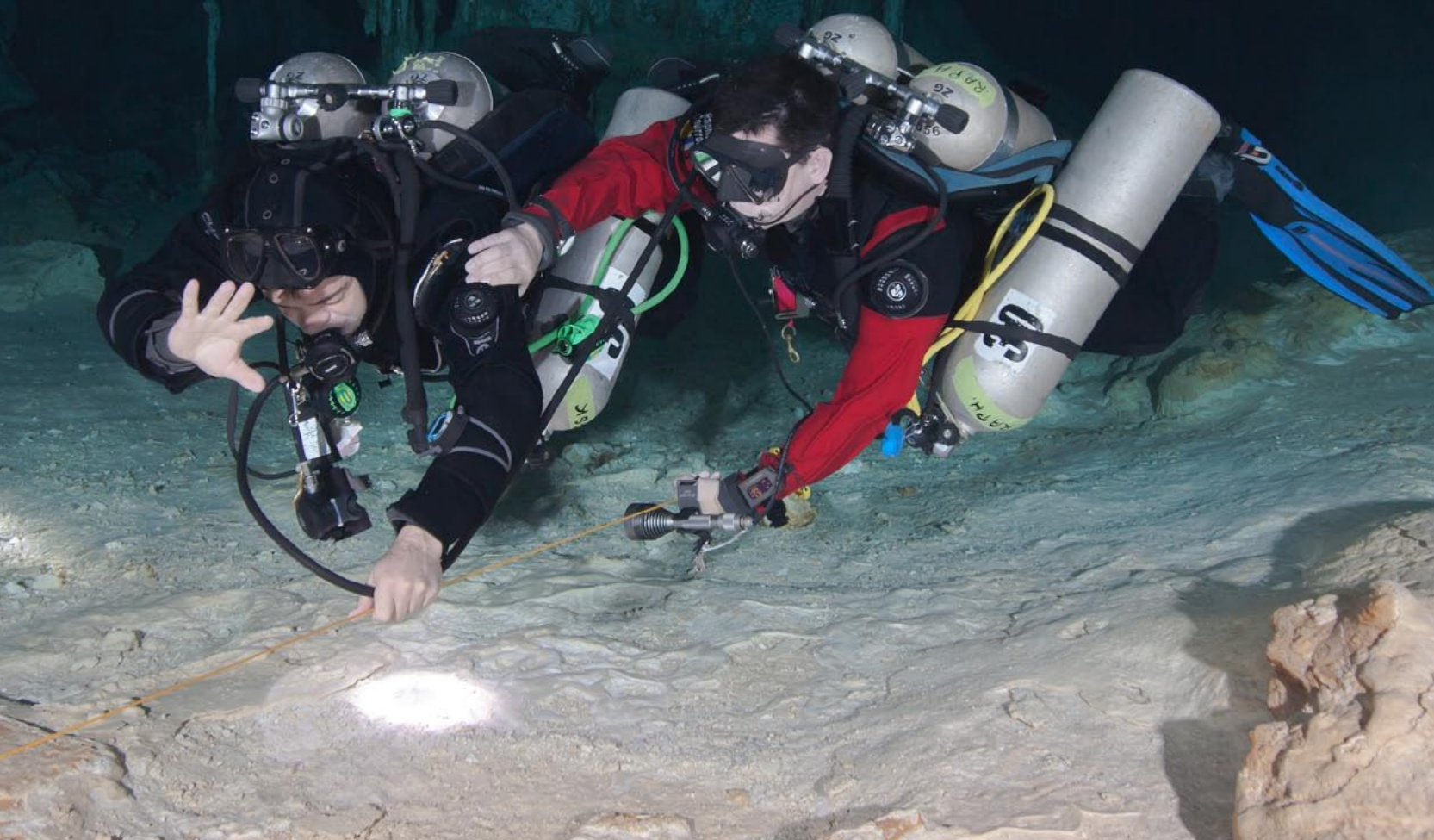
Air sharing and touch contact

cave training, like level 1. In the "classic" curriculum, all these skills are integrated during the course.