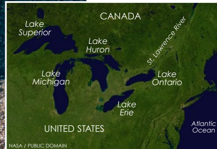
Satellite map of Great Lakes (left); Diver at propeller of the car ferry, Milwaukee (far left), with train truck under it